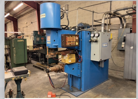
200 KVA Sciaky Model PMCO-4STQ200 Spot Welder (Rebuilt by TJ Snow)