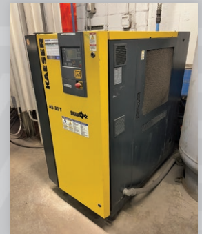
30 HP Kaeser Model AS30T Air Compressor