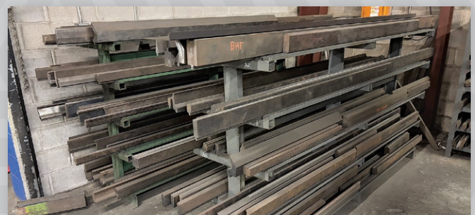
Large Quantity of Various Press Brake Dies Including 4-Way Dies, Top & Bottom Dies