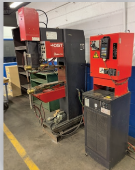
80 KVA Amada Model ID-40-ST Spot Welder