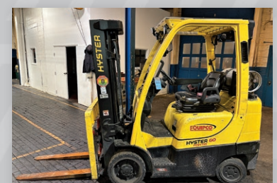
(4) 2016 - 6,000 Lb. Hyster S60FT LP Gas Solid Tire Lift Trucks (Low Hours)