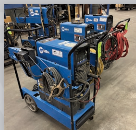
(7) Miller Dynasty 350, 300DX, 280, 200 Welders