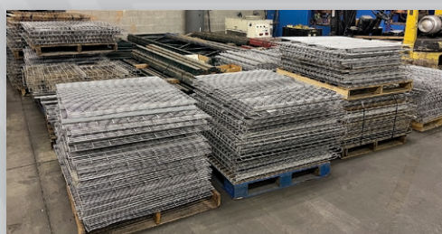
(30) Sections of Various Size Disassembled Pallet Rack w/Decking