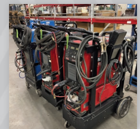
(2) Lincoln Aspect 375 Welders