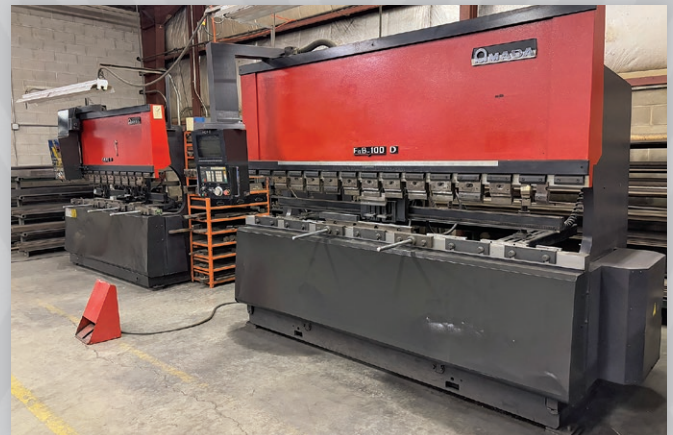
110 Ton x 118" Amada Model FBD-1030F Press Brake