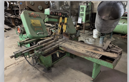
12" x 16" DoAll Auto Horizontal Band Saw