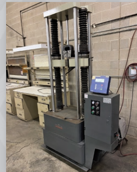
Tinius Olsen Model Electromatic EP2 Tensile Tester