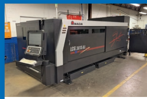
3,000 Watt Amada Fiber Laser

CIA-INDUSTRIAL.COM 2020 DUNLAP ST. CINCINNATI, OH 45214 513.241.9701