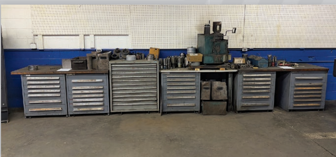
Very Large Quantity of Various Punch Tooling