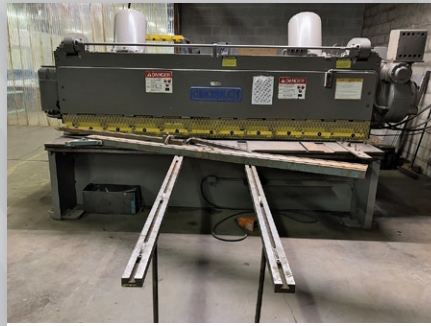
3/8" X 10' Cincinnati Model 2510 Power Squaring Shear