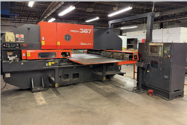
30 Ton Amada Pega 306072 CNC Turret Punch