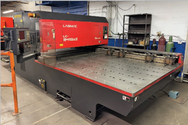
1,500 Watt Amada Model LC2415A2 CNC CO2 Laser