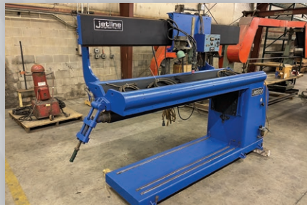
5' Jetline Seam Welder