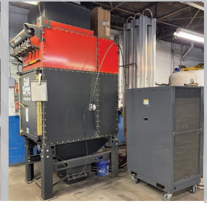
3,000 Watt Amada Model LCG3015AJMII CNC Fiber Laser (New 2017)