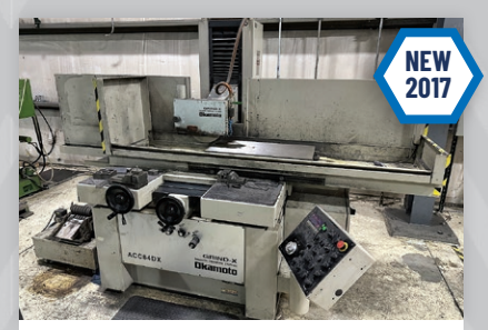
16" X 32" Okamoto ACC-84DX Grinder