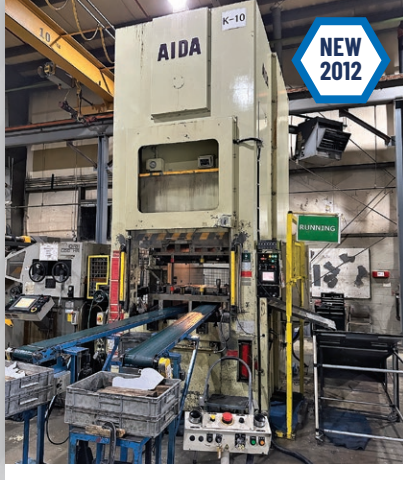
550 Ton Aida S1-5000E SSSC Press