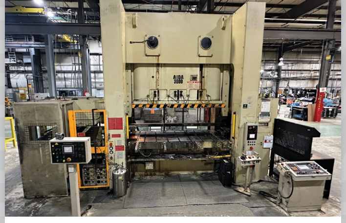
330 Ton Aida and 440 Ton Komatsu SSDC Presses