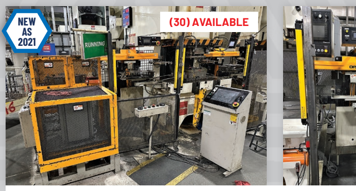
(30) Orii Servo Transfer, Load and Unload Robots