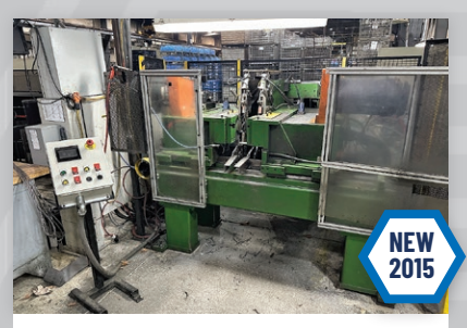
Haven 939 D.E. Finisher