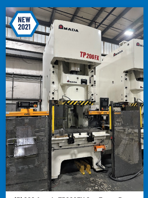
(3) 220 Amada TP200FX Gap Frame Press