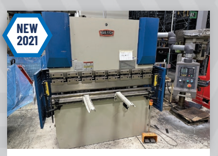
33 Ton x 63" Baileigh CNC Brake