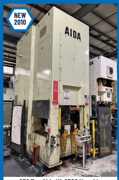
630 Ton Aida K1-6300 Knuckle Joint Press