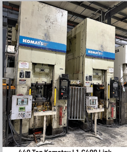
440 Ton Komatsu L1-C400 Link Drive Presses