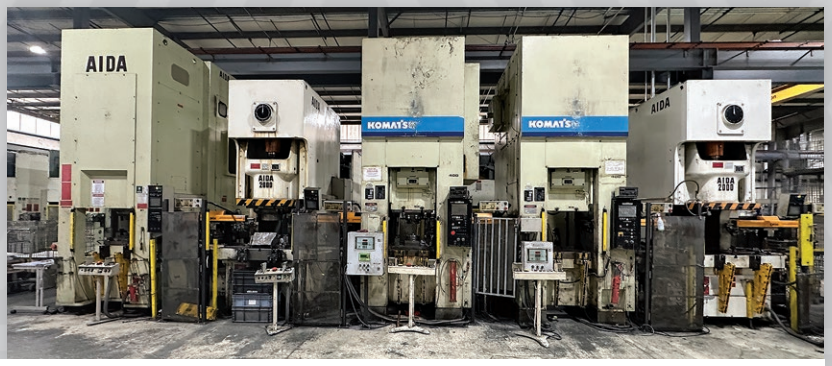
(4) Different Press Lines w. up to (12) Presses Including Orii Transfer, Load and Unload Robots