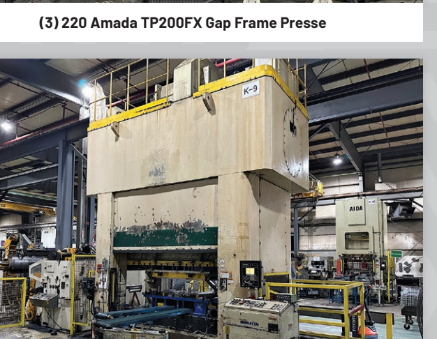
440 Ton Komatsu Model L2M400-3BM SSDC Press