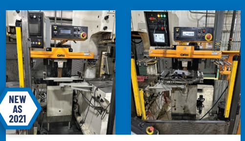
(30) Orii Servo Transfer Robots