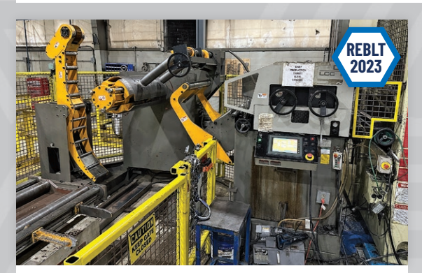
(5) Orii Compact Servo Feed Lines