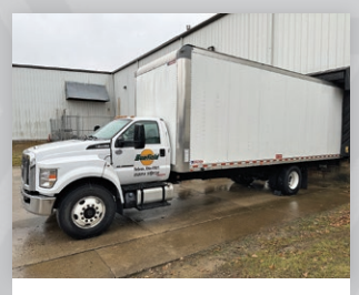
2021 Ford F-750 Box Truck