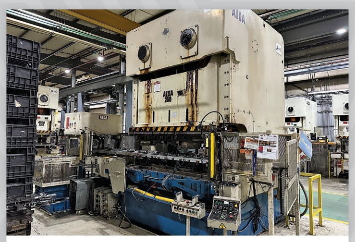
(2) 275 Ton Aida NC2-250(2) Double Crank Gap Frame Presses