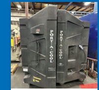
(8) Port-A-Cool Units