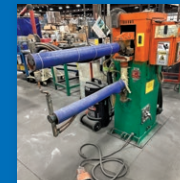
(5) Spot Welders