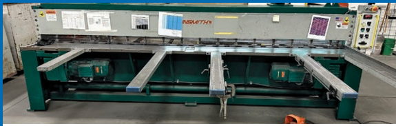
10 Ga. x 12' Tennsmith LM1210 Shear (New 2015)