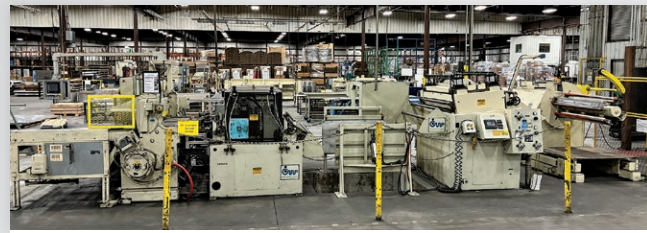
48" x .062" x 10,000 Lb. CWP Cut-to-Length Line 1

CIA-INDUSTRIAL.COM 2020 DUNLAP ST., CINCINNATI, OH 45214 513.241.9701