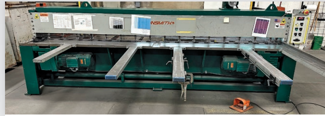
(6) Squaring Shears from 52" to 12' (New as 2015)