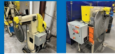
Rotary Flanger / Beaders