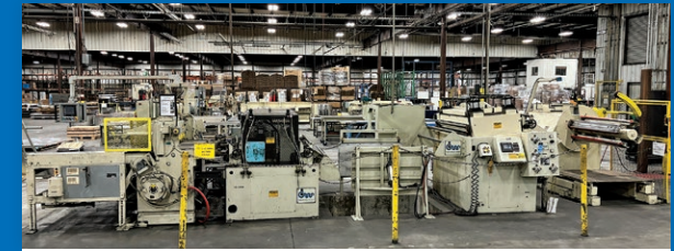
48" x .062" x 10,000 Lb. CWP Cut-to-Length Line