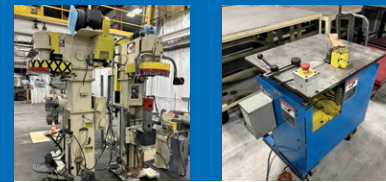
Various Horiz. / Vert. Flangers