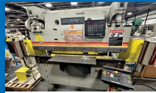
60 Ton Accurpress Brake