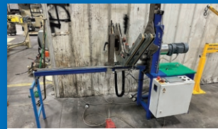
Hornug TSK600 Flanger / Beader (2017)