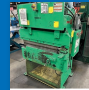
20 Ton Press Brake