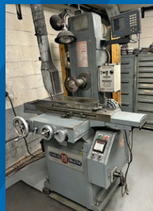
8" x 18" Parker Majestic Surface Grinder with Sony DRO