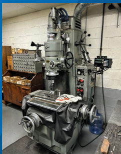
Moore No. 618 Jib Grinder