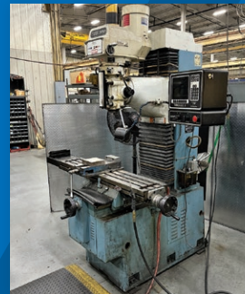
3 HP Trak Model DPM CNC Vertical Mill