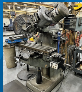
2 HP Bridgeport Vertical Mill with DRO