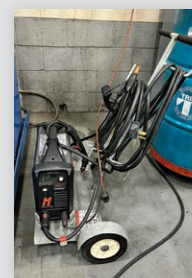
Hypertherm Powermax 45 Plasma Cutter