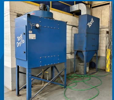
(2) Torit Dust Collectors