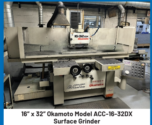
16" x 32" Okamoto Model ACC-16-32DX Surface Grinder