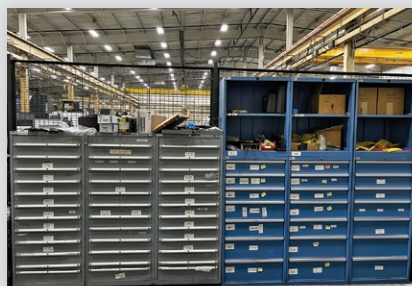
Tooling Cabinets and Tooling Throughout Facility