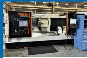
Mazak Turning Centers

CIA-INDUSTRIAL.COM 2020 DUNLAP ST. CINCINNATI, OH 45214 513.241.9701