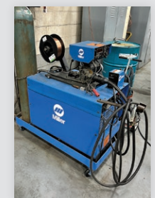
450 Amp Miller Deltaweld 450 Welder with Wire Feed