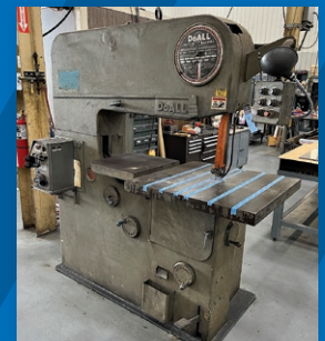
36" DoAll Vertical Band Saw