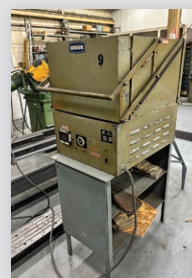
Cress Model C-122STCZ Electric Furnace