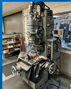
Moore No. 3 Jig Grinder