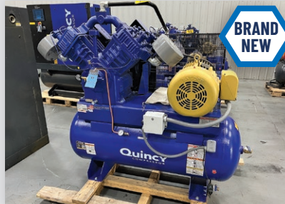
30 HP Quincy Model BM5120St Air Compressor