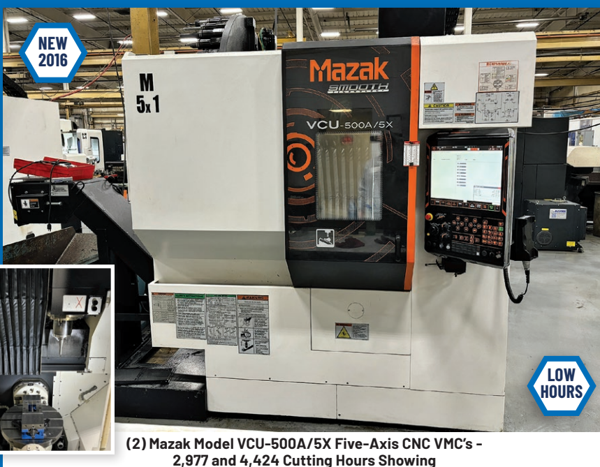
(2) Mazak Model VCU-500A/5X Five-Axis CNC VMC's - 2,977 and 4,424 Cutting Hours Showing