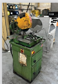
14" Doringer Model D350 Cold Saw