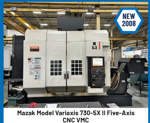
Mazak Model Variaxis 730-5X II Five-Axis CNC VMC