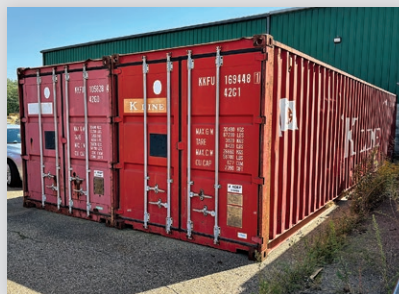
(2) 40' Containers