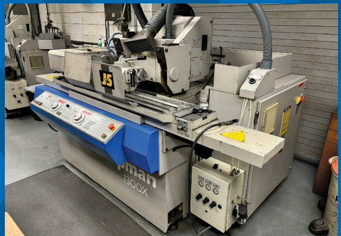
(2) 13" x 40" Jones and Shipman Model 1300X1000 Cylindrical Grinders