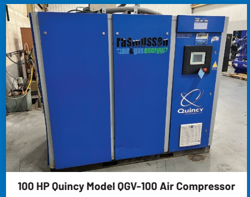
100 HP Quincy Model QGV-100 Air Compressor