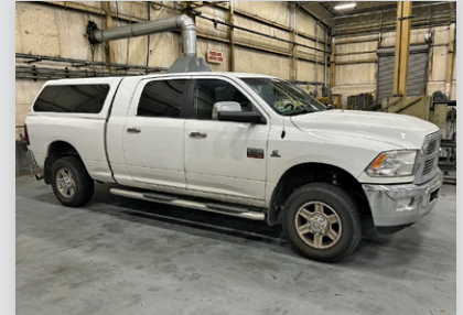
2010 Dodge Ram 2500 Heavy Duty Diesel Quad Cab Pickup Truck