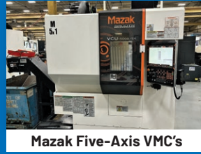
Mazak Five-Axis VMC's