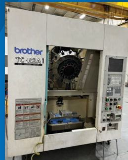
Brother Model TC-R2A CNC Drilling and Tapping Center