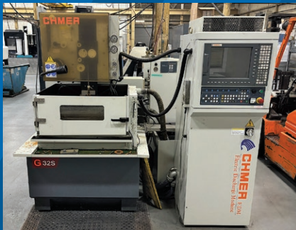
Chimer Model G32S CNC Wire EDM