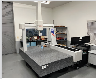
LK Model G90C CMM