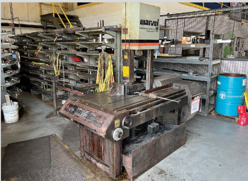
18" Marvel Series 8 Mark II Tilt Frame Vertical Band Saw