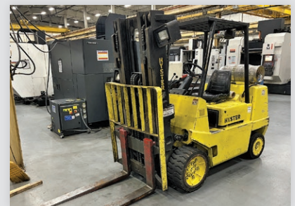
8,000 Lb. Hyster S80XL LP Gas Solid Tire Lift Truck