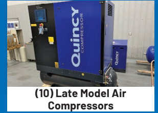
(10) Late Model Air Compressors