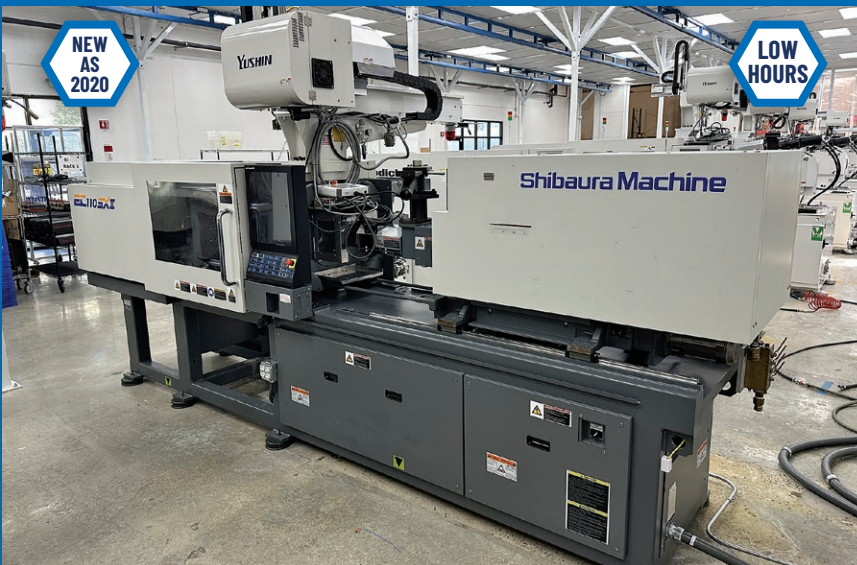
(8) 110 Ton Toshiba Model EC110SX Plastic Injection Molders