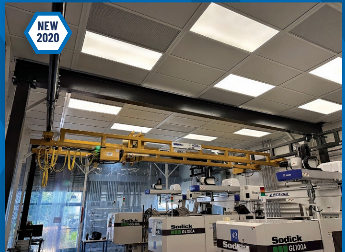
2-Ton x 25' Span x 63' Long Space Free-Standing Modular Crane System