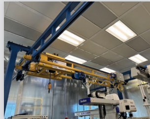
Gorbel Free-Standing and Ceiling Hung Crane Systems