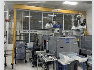
Spanco A-Frame Cranes to 2 Ton