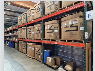
Well Maintained Shop, Support and Warehouse Equipment