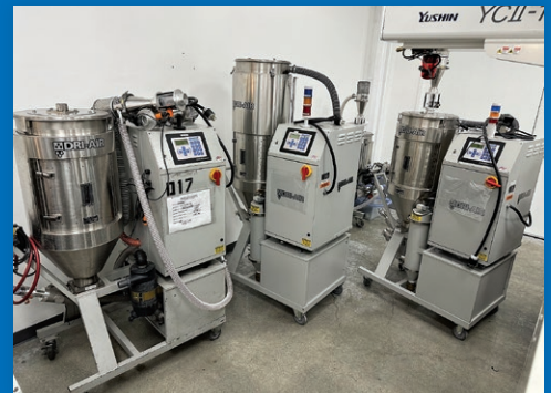
Very Clean Plastic Auxiliary Equipment