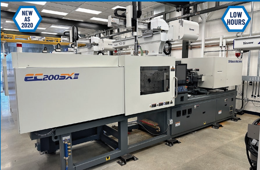
(20) Toshiba Electric Plastic Injection Molders from 250 Ton to 66 Ton

INSPECTION: Day prior to Auction Date or by appointment with jeffjr@cia-industrial.com