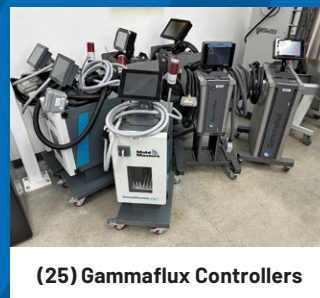
(25) Gammaflux Controllers