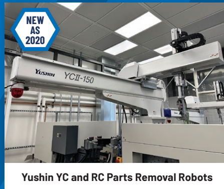
Yushin YC and RC Parts Removal Robots