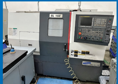
CNC and Toolroom Machinery