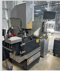
Sodick Die Sinker EDM