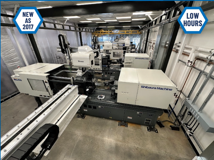
(3) 253 Ton x 5.3 Oz. Toshiba Model EC250SX Plastic Injection Molders