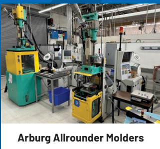
Arburg Allrounder Molders