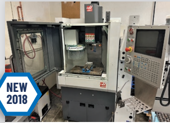
Haas CM-1 CNC VMC