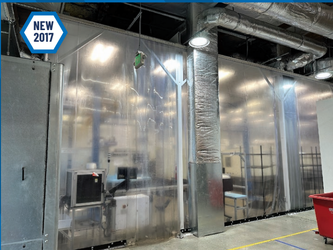
(2) 30' x 60' Soft Side Clean Rooms by Technical Air Products