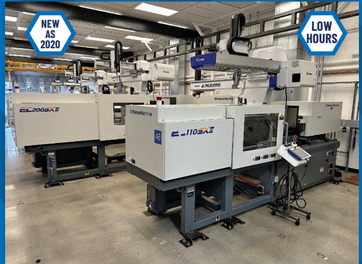
Toshiba Model EC200 and EC110 Plastic Injection Molders