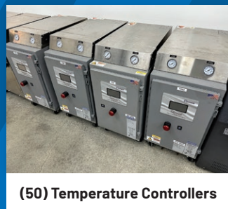
(50) Temperature Controllers