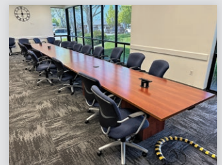
Late Model Very Clean Office Furniture and Equipment