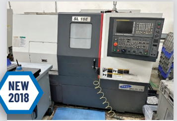
Samsung SL15E CNC Turning Center