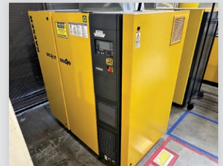
(6) Kaeser Air Compressors to 50-HP