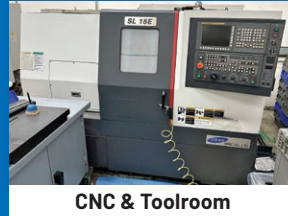
CNC & Toolroom