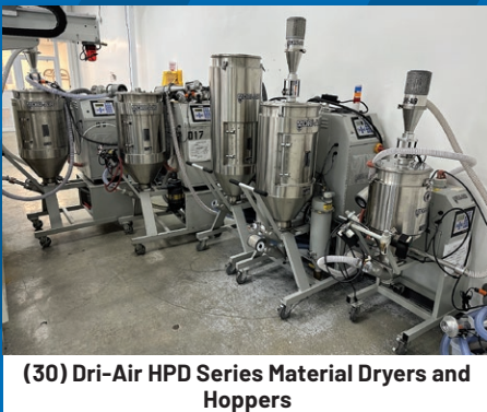
(30) Dri-Air HPD Series Material Dryers and Hoppers