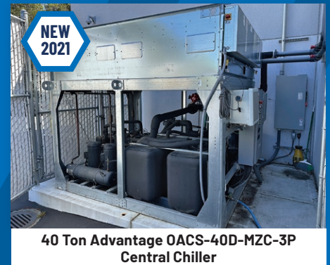
40 Ton Advantage OACS-40D-MZC-3P Central Chiller