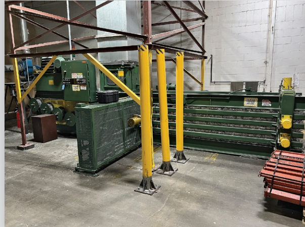
(2) 30" x 36" Auto-Tie Horizontal Balers