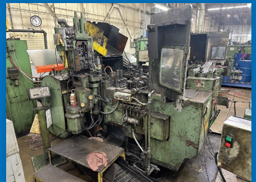
3/8" National 4-Die S-3 Boltmaker