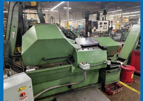
5/8" EW Menn Model GW120H Thread Roller