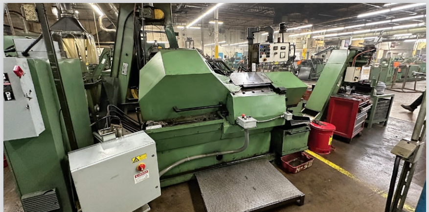
5/8" EW Menn Model GW120H High Speed Thread Roller