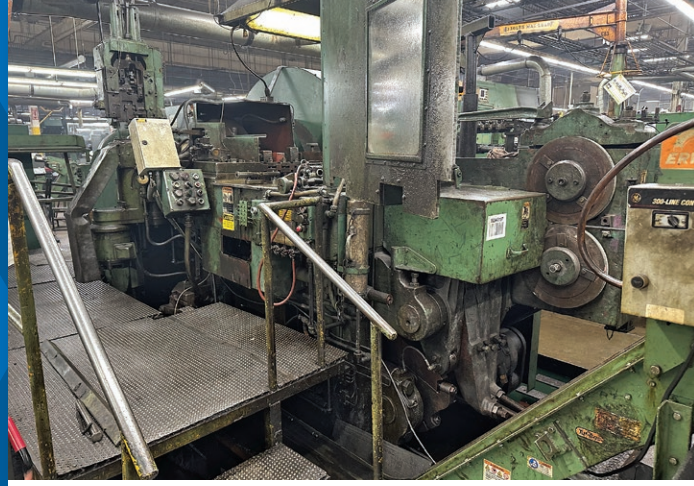
1/2" National 4-Die Long Stroke Progressive Header