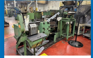
1" Waterbury Roller