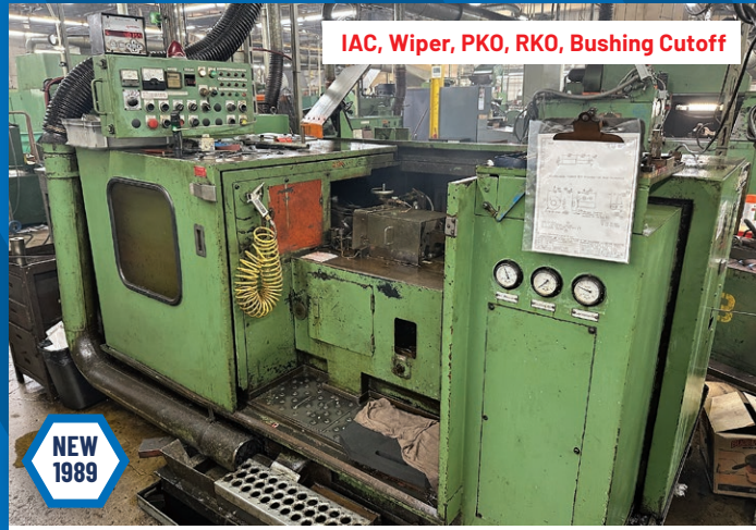
IAC, Wiper, PKO, RKO, Bushing Cutoff