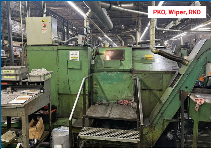
PKO, Wiper, RKO