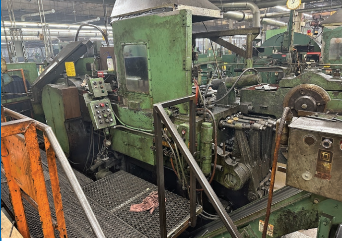
1/2" National 4-Die Long Stroke Boltmaker