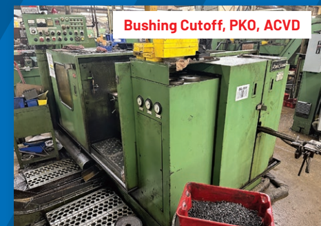
Bushing Cutoff, PKO, ACVD