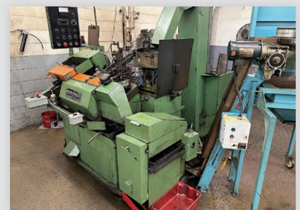
1/4" Warren Thread Roller