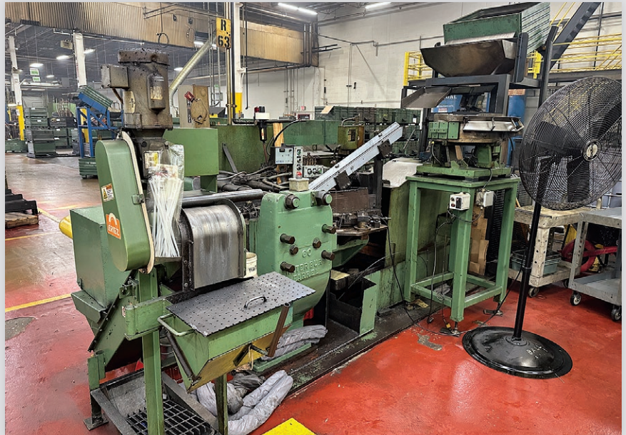
1" Waterbury Farrel No. 60 Hand Feed Thread Roller