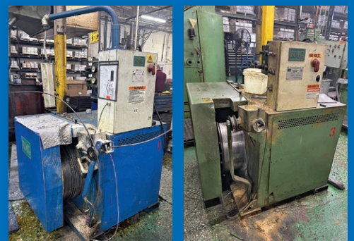
(10) RMG Wire Drawers to 1/2"