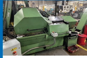
5/8" Menn Roller