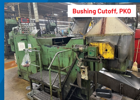
Bushing Cutoff, PKO