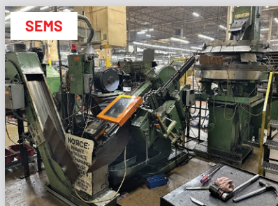
1/2" Waterbury No. 30 SEMS Incline Thread Roller