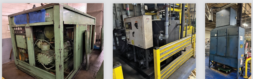
Air Compressors, Chillers and Dust Collectors