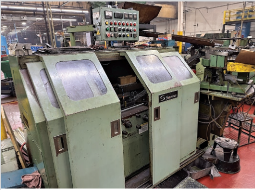
Sanmei Model THI-12AL Thread and Form Rolling Machine